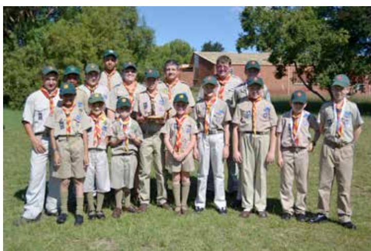
3rd Newcastle Scout Group with our medals and trophy from the Marathon